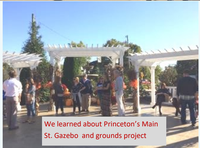
We learned about Princeton's Main St. Gazebo and grounds project