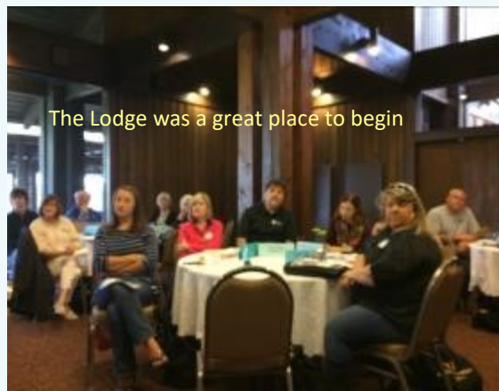
The Lodge was a great place to begin