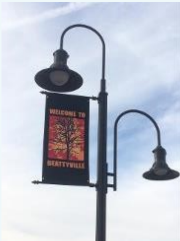
We loved seeing the street lights in Guthrie and Beattyville. They closely resemble our National Main Street logo.