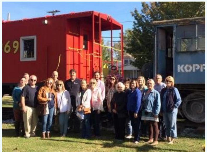
We had a great conference! Can't wait to see y'all again in January!!