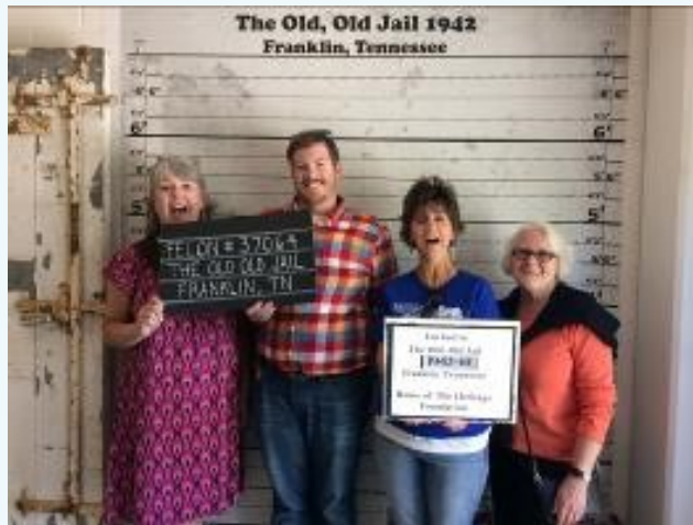
A few of us traveled to visit Franklin, Tennessee. They put us in jail, but decided not to keep us!